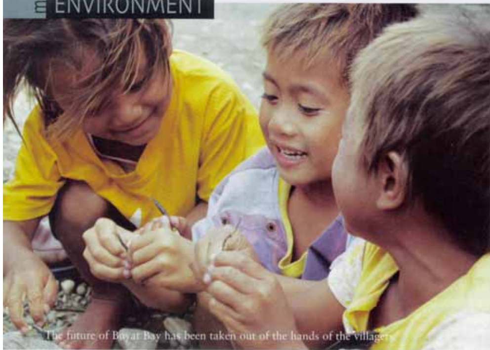
The future of Buyat Bay has been taken out of the hands of the villagers.

It was in July that allegations of skin ailments intensified in the local press and then in the national media. Non-government organisations took up the cause of the villagers in the maelstrom of media coverage.